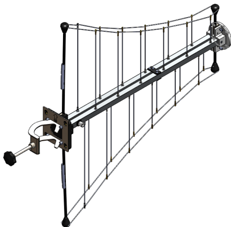
Showing mounting on LPDA-A0076