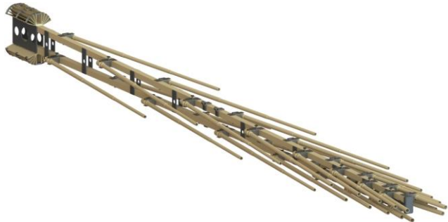
Figure 2: Antenna in stowed configuration